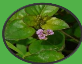
Punarnava extract (1g)