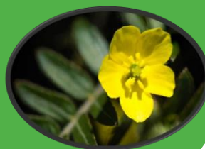
Gokhru extract (2g)