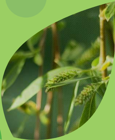
Aspirin (from willow bark)