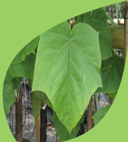
Digoxin (from fox glove)